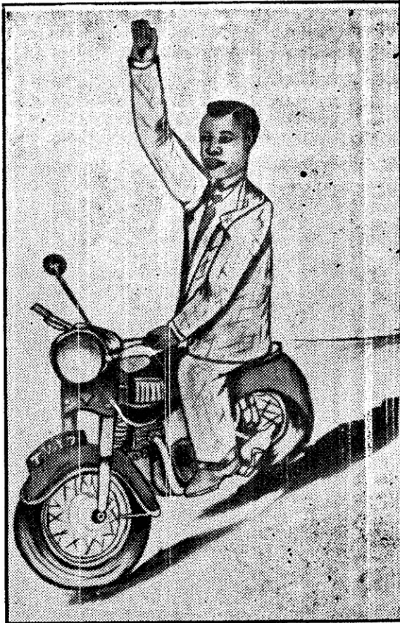
The man scooter

cash. Well then, there is no argument in